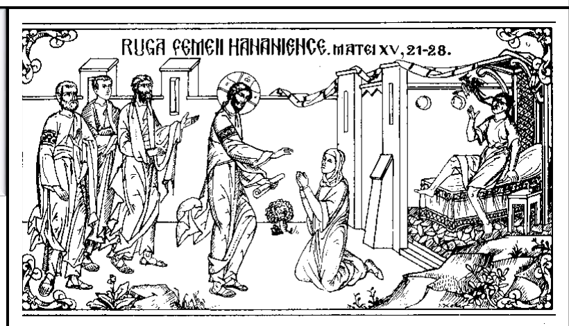
The Seventeenth Sunday after Pentecost Apostol: Hebrews 7:7-17; 2 Corinthians 6:16-18; 7:1 Gospel: Luke 2: 22-40; Matthew 15:21-28 (The Canaanite Woman) Tone 7 † Resurrection Gospel 10

ICON AUCTION – February 9<sup>th</sup> we will have our Icon Auction; you will have the opportunity to take an icons dear to you to bless your home for 40 days while enjoying a good meal at St. Nicholas.